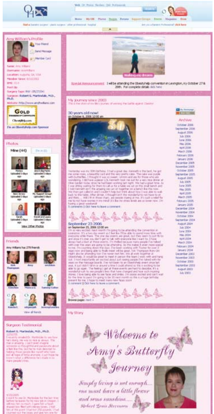
Amy has over 275 friends!